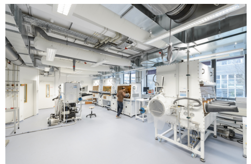
A look inside the Helmholtz Innovation Lab HySPRINT. Major work on the printable perovskite-LEDs was carried out here.